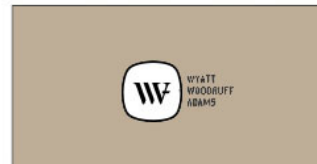
Front of Final Version