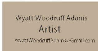
Back of Version 1