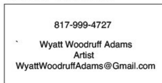
Back of Version 3