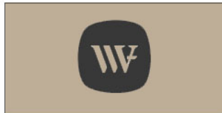
Front of Version 1