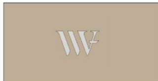
Front of Version 2