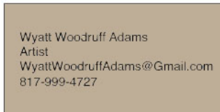
Back of Version 2